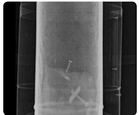
Oil & gas pipe weld